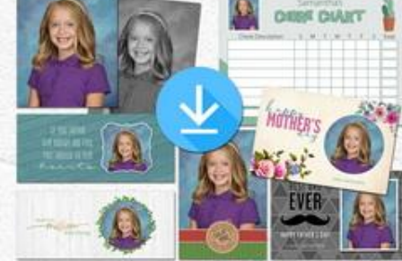
Image Pack Deluxe Digital Download (includes templates, all backgrounds and