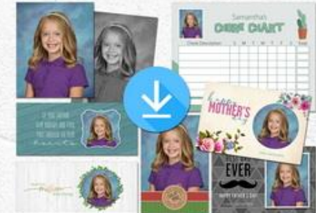
unlimited copyright release)